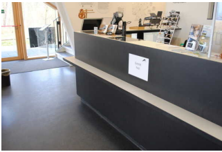
Kasse, Rezeption und Shop