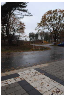
Weg vom Bussteig zum Eingang