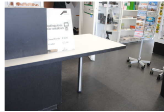
Kasse, Rezeption und Shop