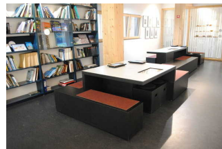
Exhibition 2.Floor Bibliothek