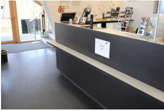
Kasse, Rezeption und Shop