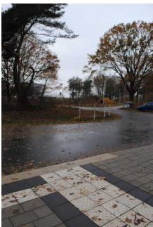
Weg vom Bussteig zum Eingang