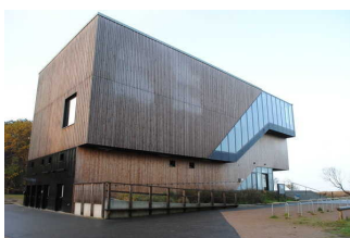
Weg vom Parkplatz für Menschen mit Behinderung zum Eingang