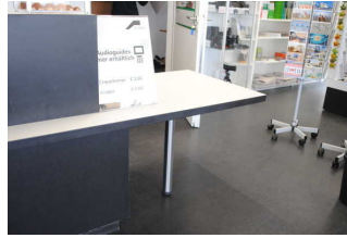
Kasse, Rezeption und Shop