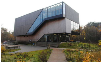
UNESCO- Weltnaturerbe Wattenmeer - Besucherzentrum Cuxhaven