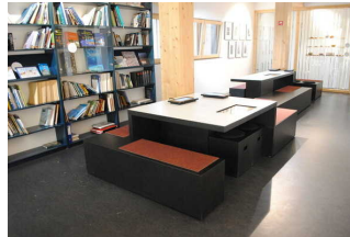
Exhibition 2.Floor Bibliothek