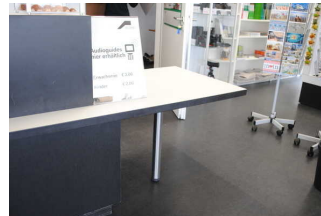
Kasse, Rezeption und Shop