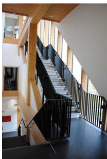
Treppenhaus von Erdgeschoss bis 2.OG