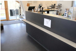
Kasse, Rezeption und Shop