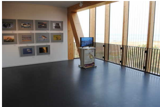
Exhibition 2.Floor Spezial Exhibition