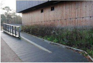
Rampe auf dem Weg vom Parkplatz und ÖPNV zum Eingang