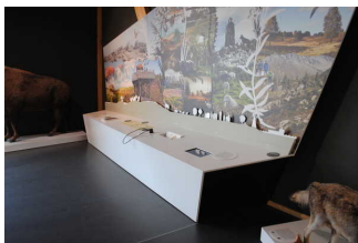
Exponat Heide und Geestkliff im 1.OG