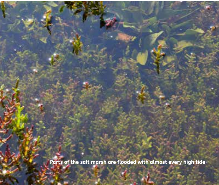
Parts of the salt marsh are flooded with almost every high tide

Please also respect any additional local rules.