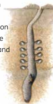
Intertidal rove beetle with breeding burrow (left side)